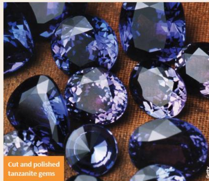
Cut and polished tanzanite gems