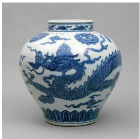
Early 15 th century, Porcelain with cobalt blue