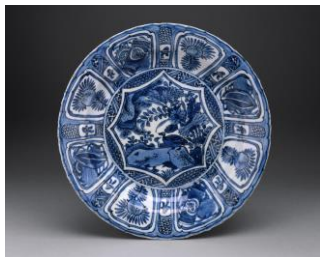
Late 17 th century Porcelain with cobalt blue, for European market