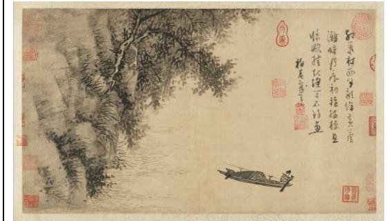
Fisherman (with poem) c.1350 Handscroll- ink on paper