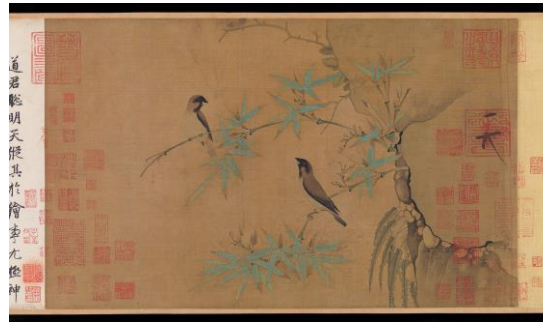
Finches and Bamboo Early 12 th century Handscroll- ink and colour on silk